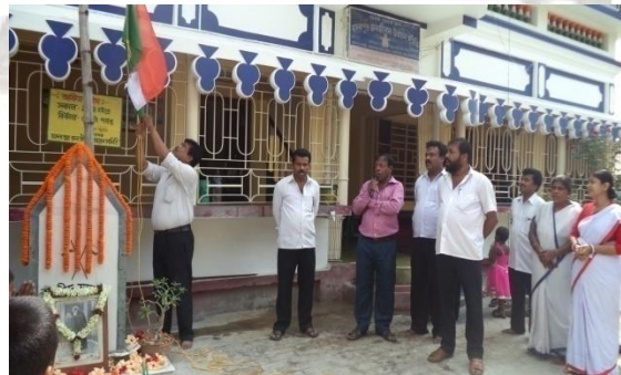
Rabindranath Tagore's Birthday