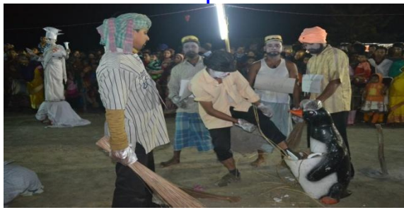
A programme of Sachha Bharat Avijan